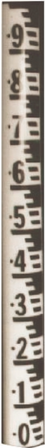
Fig. 1 Curved Gauge Plate